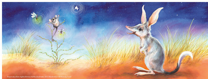
'Twinkle, Twinkle, Little Star', the original verse, published by Hachette Australia, 2016.