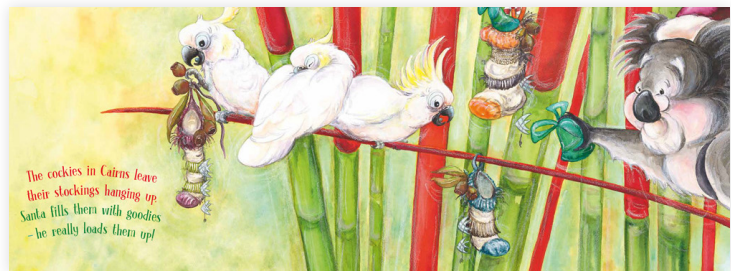
'The Bush Santa', published by Hachette Australia, 2016.